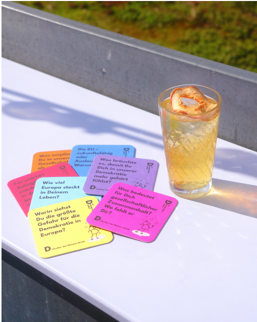
WDC-Drink The Companion / © IMA Clique