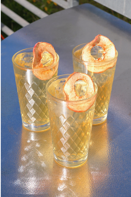
WDC-Drink The Companion / © IMA Clique